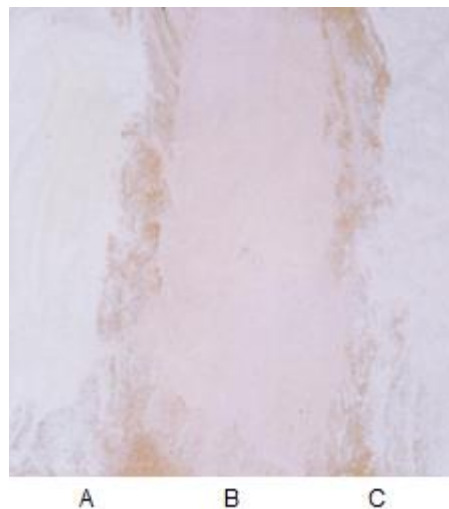
Fig. 5. Dry milled starch. A = Pop corn, B = Red Guinea corn, C = White guinea corn.