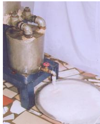
Fig. 4. Soy milk during processing.