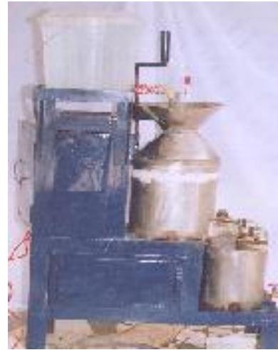
Fig. 3. Fabricated grains drink machine in operation.

different from the value 79.48% obtained at a speed of 1400rpm for the dehulled white maize.