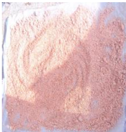
Fig. 6. Dry residue from red guinea corn after processing.

The high blending efficiency observed in all the grains when blended with speeds of 1300rpm and 1400 rpm could be as a result of high shear force generated due to high speed of rotation (centrifugal force) of the central shaft. This observation agrees with the result of an earlier study (Jayesh, 2009) where speed of blending was found to be a key factor to blending efficiency whereby lower blending speeds provides lower shear forces and higher blending speeds provides higher shear force and segregation of the granules.