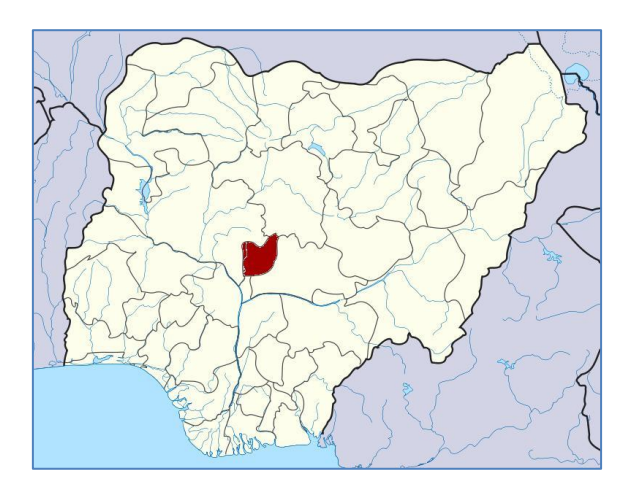
Fig. 1: Nigeria map showing location of Abuja highlighted

This research will be carried out in the Federal Capital Territory Abuja, which is the capital city of Nigeria, with an estimated population of 5 million (Federal Capital Territory Administration, 2014). Abuja hosts many on-going construction activities, and it is expected that majority of the construction firms there are aware of project cost control practices. The geographical location of Abuja in Nigeria is shown in Fig 1.