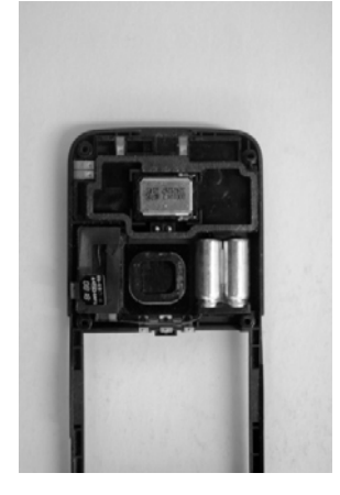
Figure 2. Antenna location of the Nokia 6220c

directly at the phone. The phone was placed with its back facing towards the horn antenna. The phone – horn antenna separation distance was kept constant. Participants were asked to sit to the left of the mobile phone and to grip the phone with their right hand. The stool on which the participants sat was kept in the same location to ensure the participant's bodies were in the same position with respect to the phone. Seven participants took part in the study.