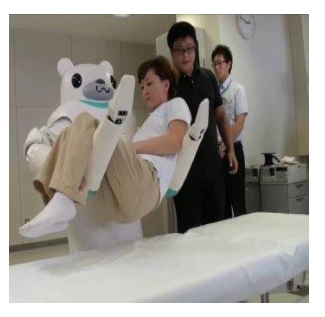
Fig.4. Robear lifting a patient unto a bed [17]

for speech recognition, speakers for speech synthesis, touch-sensitive graphical displays, actuated head units, and stereo camera systems [33]. Pearl supports telepresence which allows physicians to interact with remote patients. Another example of an assistive robot in healthcare is Robear. Robear is a giant gentle bear with a cartoonish head. Robear has the capability of lifting and transferring patients with mobility problems. Robear can also help patients to stand and turn in bed so as to prevent bed sores. Fig. 4 shows Robear assisting medical practitioners to lift a patient unto a bed.