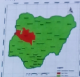
Figure 1: Map of Niger state in Nigeria

Minna is the headquarters of Chaudhry Local Government Area and the capital of Niger state in Nigeria as shown in figures 1 and 2. It lies between Latitude 9° 33' and 9° 40' North of the Equator and Longitudes 6° 29' and 6° 35' East of the Greenwich Meridian on a geological base of an undifferentiated basement complex of mainly gneiss and magnetite (Max Loek, 1979).