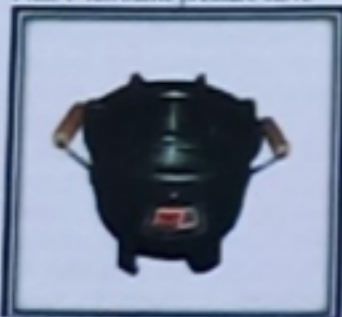
Plate II: Charcoal efficient stove