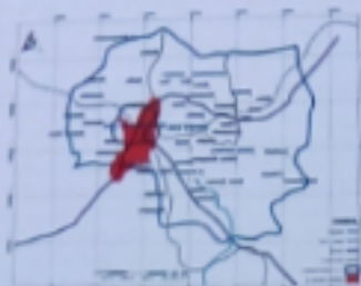
Figure 3: Minna in Borno/Chaudhry Local Government Areas

With the creation of the Federal Capital Territory, Minna as depicted in figure 3 has become enhanced in all her developments as more people are attracted to the town. The state with an area of about 76,363km 2 is the acclaimed 'power state' of Nigeria with three hydroelectricity dams. Ironically, electricity supply has been epileptic with no neighbourhood having a light index of 1 in spite of being the power generating house of Nigeria (Oladigba, 2017).