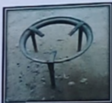
Plate V: Iron wood stove