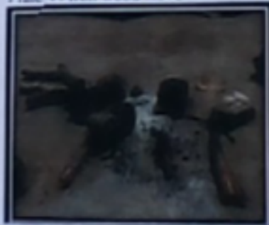
Plate VI: Stone wood stove ( Abacha stove )