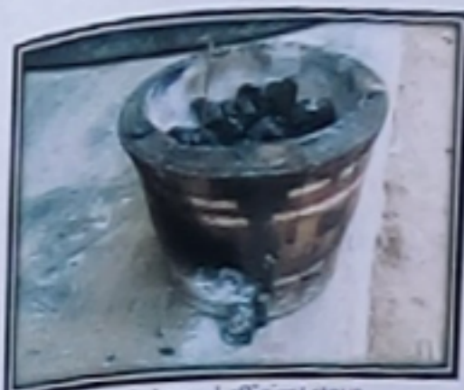
Plate VII: Local charcoal efficient stove