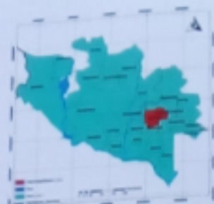
Figure 2: Local Govt Areas in Niger State Source: URP Department, FUT Minna, 2016.

With the creation of the Federal Capital Territory, Minna as depicted in figure 3 has become enhanced in all her developments as more people are attracted to the town. The state with an area of about 76,363km 2 is the acclaimed 'power state' of Nigeria with three hydroelectricity dams. Ironically, electricity supply has been epileptic with no neighbourhood having a light index of 1 in spite of being the power generating house of Nigeria (Oladigba, 2017).