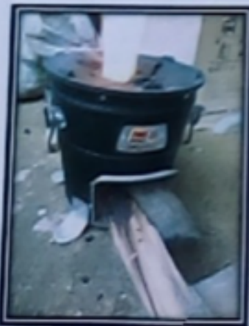
Plate III: wood efficient stove