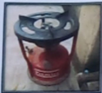
Plate I: Kerosene pressure stove