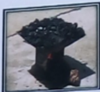
Plate IV: Iron charcoal stove