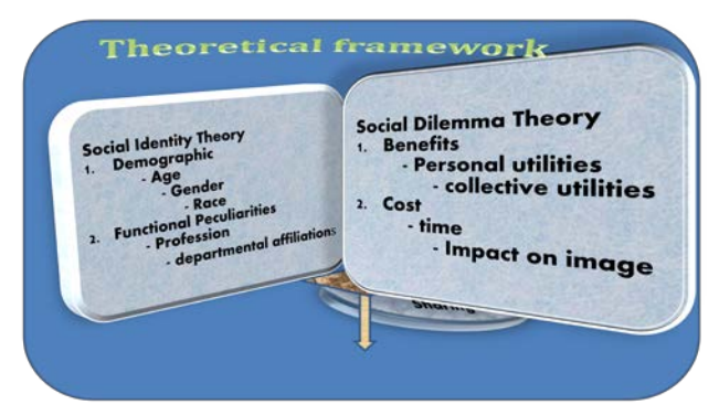
Figure 1: theoretical framework

after evaluating the benefits and costs resulting from their actions. For instance, costs in knowledge sharing include the investment of time, cognitive effort, or the fear of embarrassing oneself (Wahlroos, 2010), and if the expected costs are higher for the individuals, the stronger the knowledge sharing dilemma (Kimmerle, Wodzicki, & Cress, 2008).