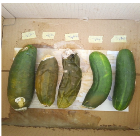
Processed shea butter oil (T3)