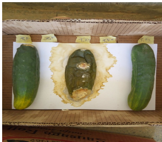
Coconut oil (T2)