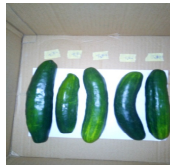
Local shea butter oil (T4)