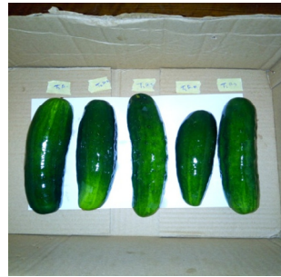
Coconut oil (T2)