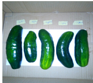
Processed shea butter oil (T3)