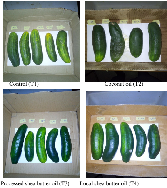
Figure 3. Diagram of coated and uncoated (control) cucumber fruits at 12DAS.