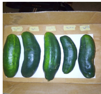
Processed shea butter oil (T3)