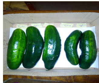
Local shea butter oil (T4)