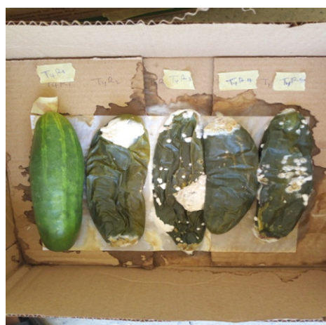
Local shea butter oil (T4)