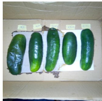
Coconut oil (T2)