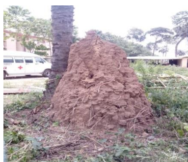
Figure 1: Type II anthill located in Afe Babalola University, Ado Ekiti Nigeria on an elevation of 1165 ft above sea level, having latitude (N7°36.409') and longitude (E005°18.627').

Anthill is a naturally occurring material which can serve as potential catalyst in transesterification process. As shown in Table 4, anthill sample contains several metal oxides in which some of them in their pure forms have been used as catalysts for biodiesel synthesis [41, 69]. An anthill is a form of siliceous or fire clay which is formed at the entrances of subterranean dwelling of ant colonies [77-78]. An ant colony is an underground chamber where ants live and is being built and maintained by worker ants. According to Paton et al. [79], anthill is classified into two categories, namely type I and type II anthills. Type I nest is less noticeable in the ant territory, because it is small in size and shape. However, they are characterized by waste deposition and are easily influenced by erosion [80-81]. By comparison, types II mound as shown in Figure 1, is huge, often stick together, sometimes surrounded by vegetation and persist for many years [78].