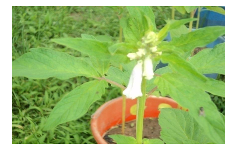
Fig. 1 Kenana 4 at maturity showing the flower buds