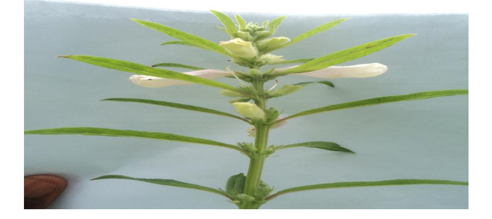
Fig 2. Ex- Sudan at maturity showing the flower buds

Variety Ex- Sudan and E8 had the highest pollen per flower (16,750 pollens) while Kenana4 had the lowest (16,688 pollens). The same trend occurred in the number of pollens per anther. For the number of pollens per plant calculated, Variety Ex Sudan had the highest number of pollens per plant (485,750). This was followed by variety Kenana4 with 483,952 and lastly variety E8 with 335,000 pollens per plant.