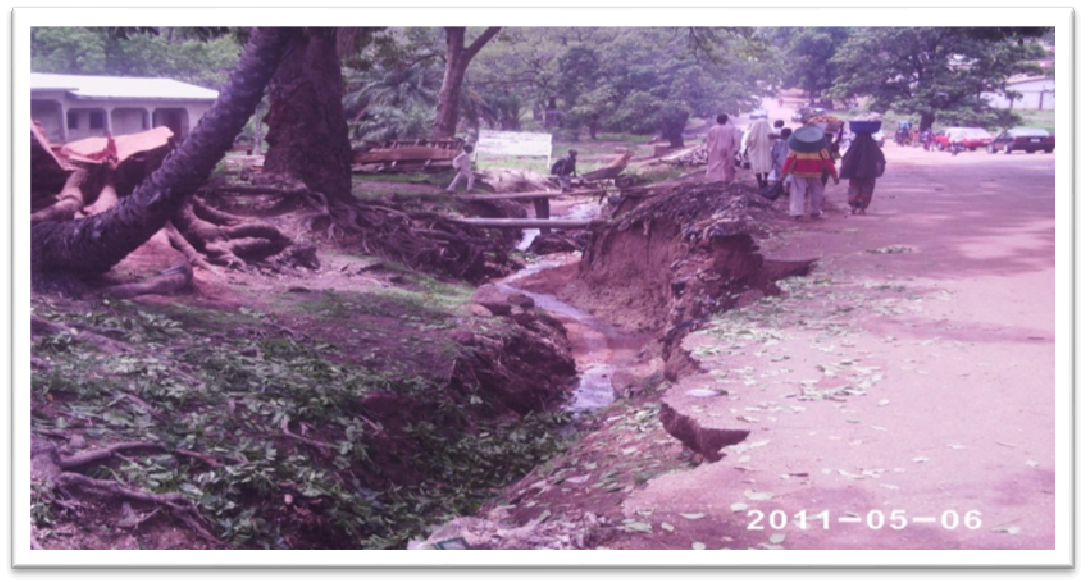
Plate II: Gullied waterway eating up a major access road

The immediate effects of rainstorm disaster vary just as what the victims believed caused the different destruction. In assessing the nature of rainstorm disaster in the study area, results of field analysis shows that the victims identified the particular rainfall related or induced environmental disaster that wrecked damage on their homes, roads, and other structures. Over 50% of the respondents asserted that the damages that occurred during rainfall were mostly triggered by strong winds and heavy downpour which further caused serious flooding. Another 21% believed the devastating effects was dues to thunderstorm and lightening, while a quarter of the victims identified flash flooding as the cause of the social and environmental destructions usually witnessed during and after the likes of the events of May 2011.