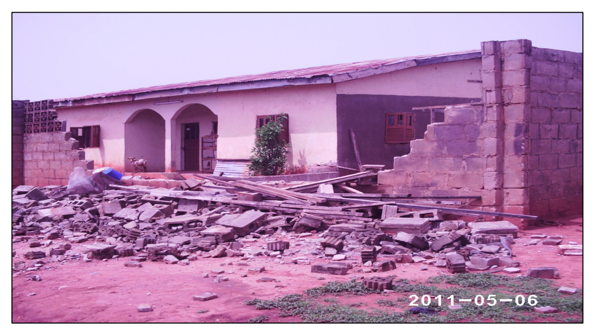
Source: Field Survey, May, 2011 Plate I: Affected Building Structure in Wadata Ward, Bida