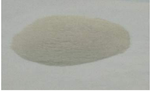
Figure 1: Calcium carbide residue

Calcium carbide residue: The CCR used in this study was collected from local welders at