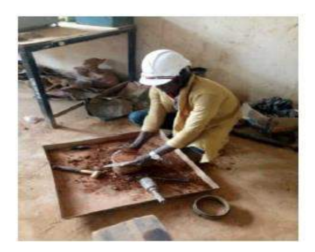
Figure 3: Compaction test on the clay soil

The method used in this study involves characterizing the untreated clay soil by determining its index properties. Atterberg limit tests were conducted on the clay mixed with 0, 5 and 10% CCR which was admixed with 0, 2, 4 and 6% zeolite. This is to evaluate the effect of zeolite on the Atterberg limits of the CCR modified clay soil. These mixtures were then compacted at standard proctor compaction energy level to determine the effect of zeolite on the compaction characteristics of CCR modified clay soil. All tests on the untreated clay soil was carried out according to the method highlighted in BS 1377 (1992). Meanwhile, for all these tests, appropriate amount of water was mixed with the clay mixed with appropriate chemicals, kept in a polythene leather and allowed for 24 hours before conducting the tests.