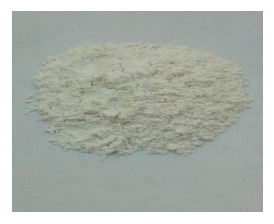
Figure 2: Zeolite sample

Zeolite: The zeolite used in this study was purchased from a commercial market in Kaduna in Kaduna State of Nigeria.