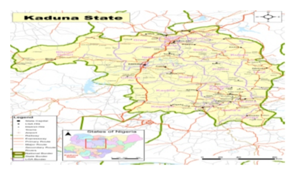
Figure 2 Map of Kaduna metropolis showing some local government areas.