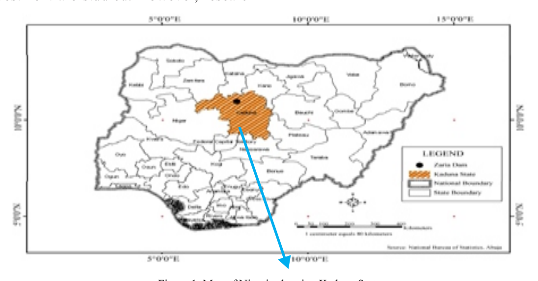
Figure 1. Map of Nigeria showing Kaduna State

The study area is Kaduna metropolis, the Administrative capital city of Kaduna state. It lies between latitude 11° 3' N and longitude 7° 25' E, located in the Northwestern region of Nigeria and shares boundary with Niger, Bauchi, Kano, Zamfara and Katsina state. The locale is a megacity made of Kaduna North and South with heterogeneous primary ethnic groups that include Gbagyi, Hausa, Fulani, Kataf, Kagoro and Jaba extractions amongst some other secondary groups. Below is the map of Nigeria (Figure 1) depicting Kaduna state, from which the map of Kaduna metropolis is extracted Figure 2.