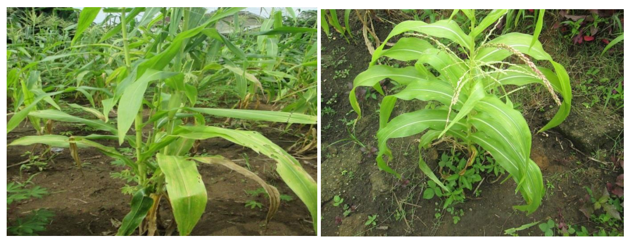
Plate I: Leaf mottling and streaking symptoms on infected maize plants

Symtoms observed on the maize fields were leaf mottling, yellowing, mosaic and streaks along the mid-rib of infected plants (Plate I). All the samples reacted negatively with MCMV and MDMV antibodies (data not shown). However, 38 % (41) of the samples exhibited strong positive reaction with MSV antibody (Table 1). Of the 41 samples that tested positive, the incidence of MSV disease was highest (51.2 %) in Kano, followed by Katsina (34.1 %). The lowest MSV disease incidence was found in Akwa Ibom and Cross River, with about 7.3 % each (Fig. 1). MSV incidence was observed at Bebeji, Garun Mallam, Kura, Dawakin Kudu, Kumbosto, Ungu and Tofa LGAs in Kano State. In Katsina, MSV was detected at Malumfashi, Musawa, Mutazu, Kankia, Charanchi, and Rimi. In Akwa Ibom State, the MSV positive samples were found at Uyo and Abak LGAs. In Cross River State, MSV was found specifically at Akai and Awi LGAs. Disease severity varied between 2 and 5 across the surveyed sites. Some of the susceptible plants were stunted and failed to produce cobs. In some others, small and deformed cobs were produced. In the late infected plants, disease severity did not affect cob formation.