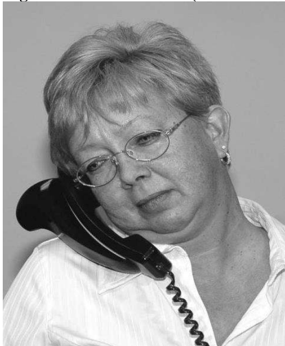
Figure 3: Neck Postures