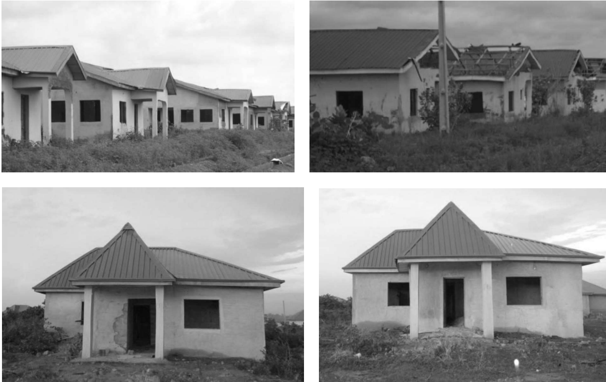
Fig 1: Prototype buildings in Minna showing variations of building components.