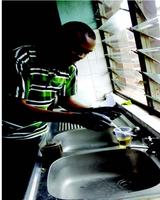
Plate 2: Urine Utilization in the soil MFC