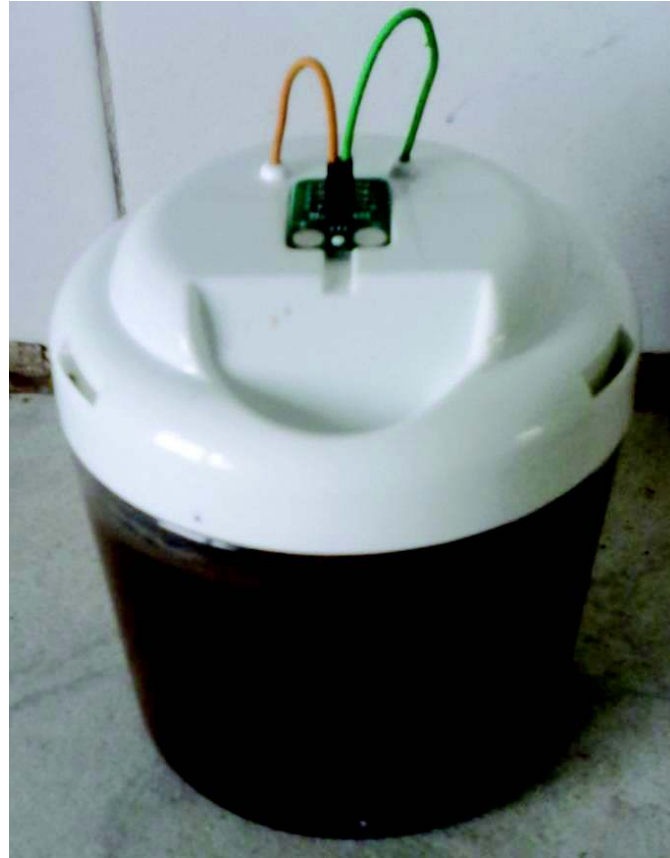
Plate 1: Soil MFC Complete Set-up